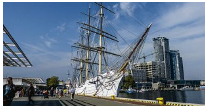
Gdynia Harbour, Poland

Poland, I have to say, is one of the surprise highlights of 2014 and one I must repeat in 2015.