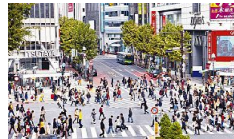
The scramble crossing of Shibuya Station, Tokyo