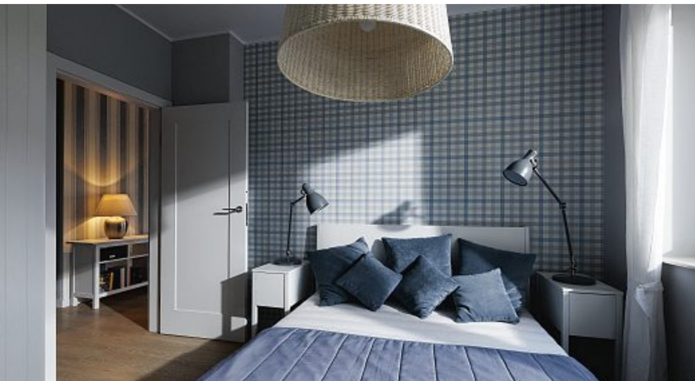
Sand Valley Villa