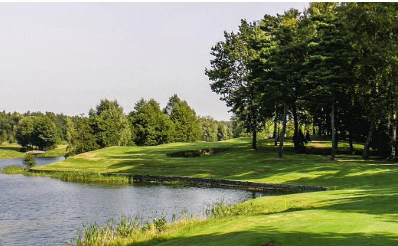
Gdansk Golf & Country Club, Poland

chef to reign supreme on a medley of Poland's finest, washed down with multiple nips of neat vodka, the Polish way of doing things. Early next morning I planned to play another quick 9-holes before we departed and when I woke up there was barely a trace of a headache - a vodka clearly of great purity and taste.