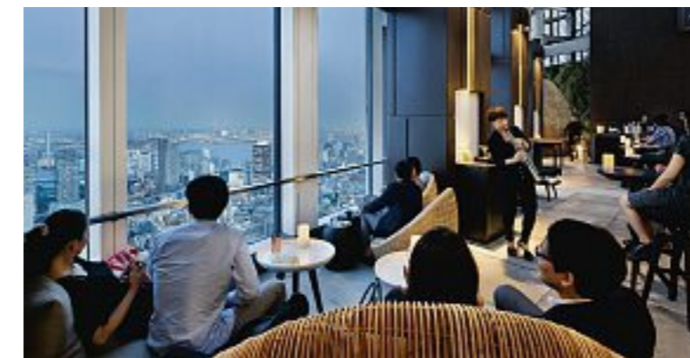
The Rooftop Bar, Andaz Tokyo

Organised and operated by Preferred Travel Services ABTA W3692 ATOL protected 5537. Subject to availability.