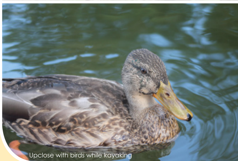
Up close with birds while kayaking