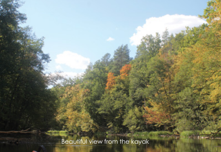
Beautiful view from the kayak