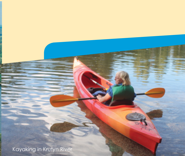
Kayaking in Krutyn River