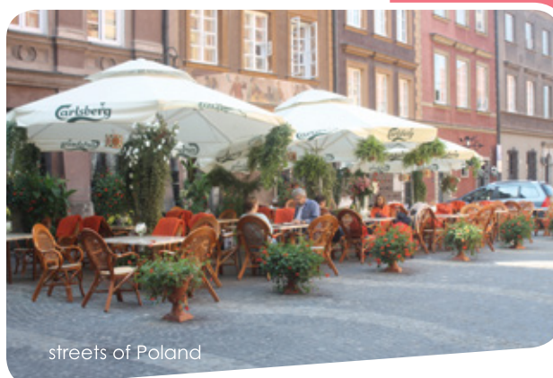
streets of Poland

is probably already on your bucket list. Fate hasn't been very kind to the country. Yet the repeated bruises and wounds are barely visible on its monuments and infrastructure. Take for instance the Malbork Castle – the castle of the Teutonic order. The largest castle in the world was almost destroyed but meticulously restored in the early 20th century using techniques which are now followed world over for conservation of historical buildings. Severely damaged again during the Second World War, the castle was restored all over again. Architecturally brilliant, the castle symbolizes power and culture.