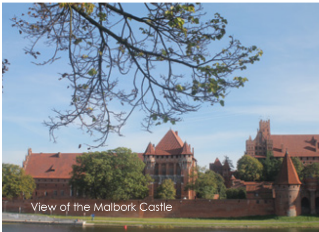
View of the Malbork Castle