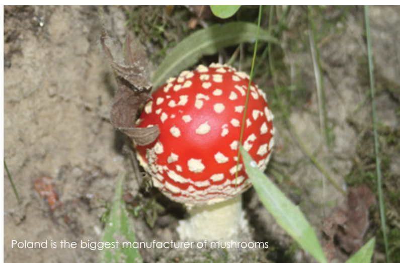
Poland is the biggest manufacturer of mushrooms