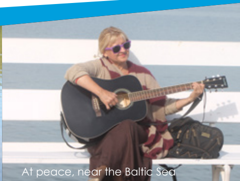
At peace, near the Baltic Sea

Open air museum in Olsztynek is likely to captivate you with its fascinating display of history. An ethnographic park more than a mere museum, it gives insights about the lives of earlier inhabitants of the region in an intriguing manner. Over ten thousand 19th and 20th century exhibits of popular culture material are displayed in replicas of houses, religious, industrial and farm architecture.