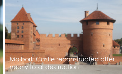
Malbork Castle reconstructed after nearly total destruction