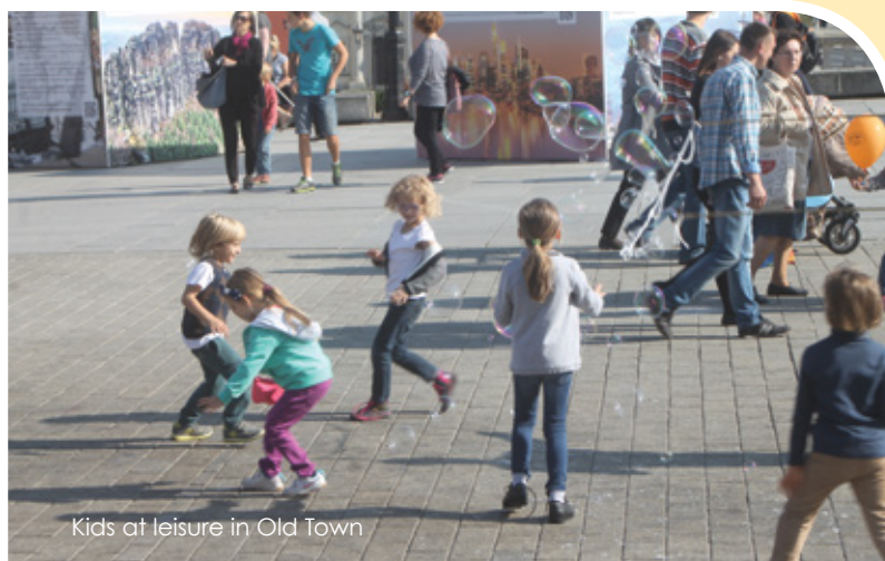
Kids at leisure in Old Town

Unexplored as a honeymoon destination, Poland can stun you with its beauty, tranquility, history and culture. Plan a trip before tourists start coming in large numbers and the prices soar! ●