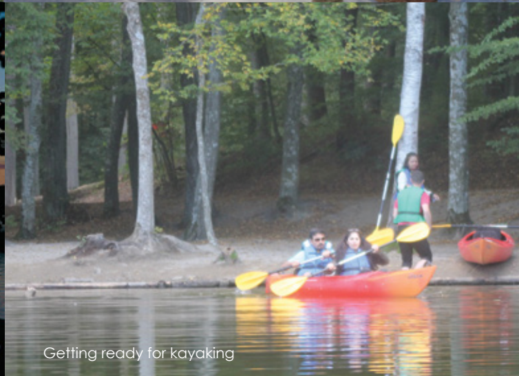
Getting ready for kayaking

cake, layered with nut cream and covered in Wedel Chocolate.